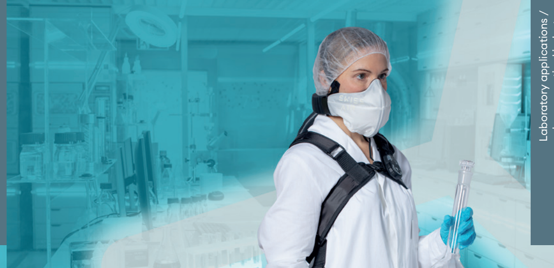
Laboratory applications / pharmaceutical industry