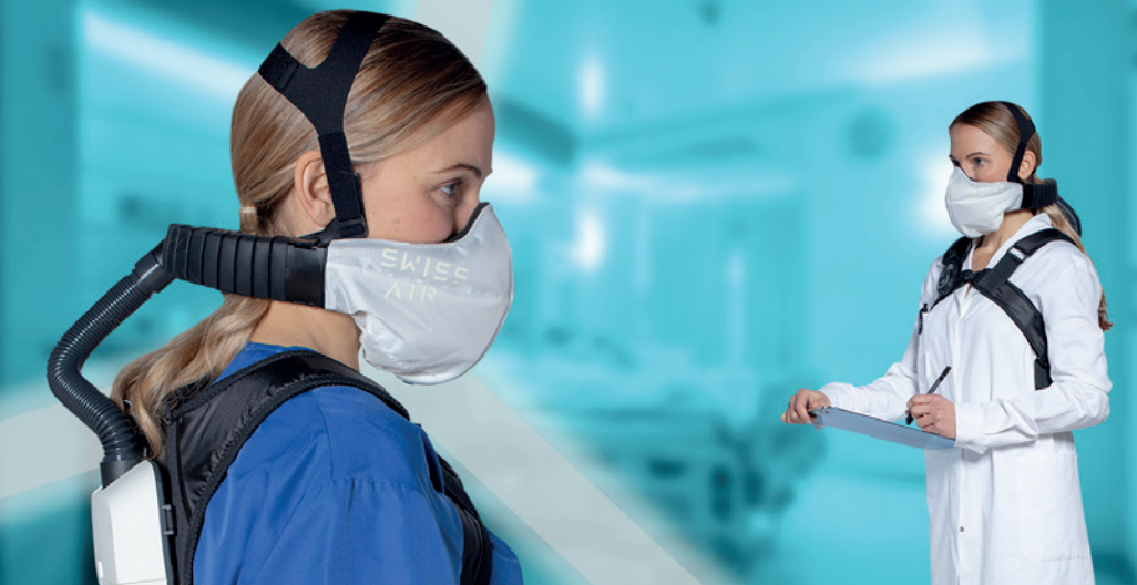
Medical applications / Health care