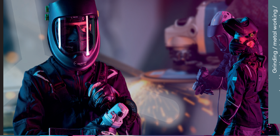
Grinding / metal working / wood working / industrial applications