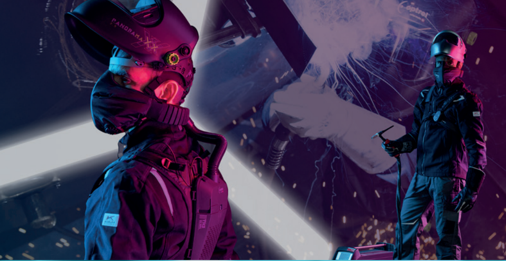
Welding / Plasma cutting