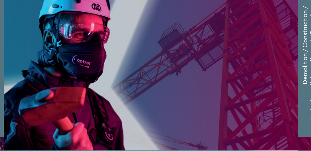
Demolition / Construction / Agriculture / Waste disposal / Recycling